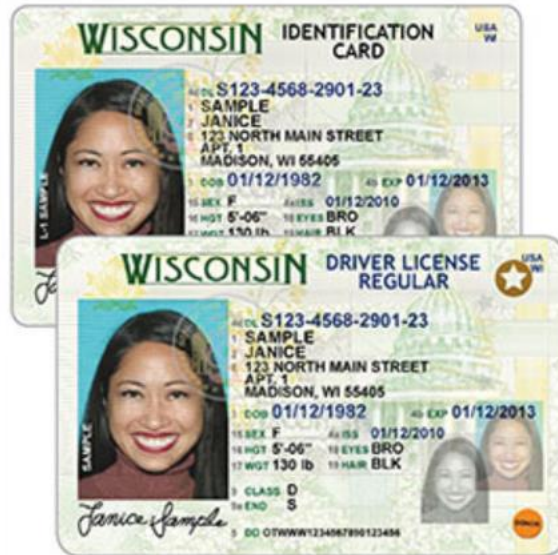
Sample cards issued March 2012 to October 2015