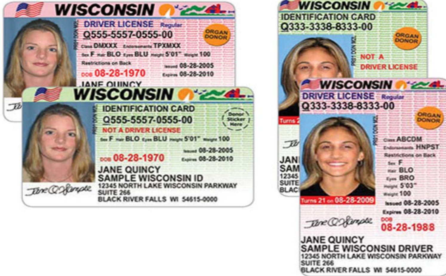
Sample cards issued September 2005 to 2012