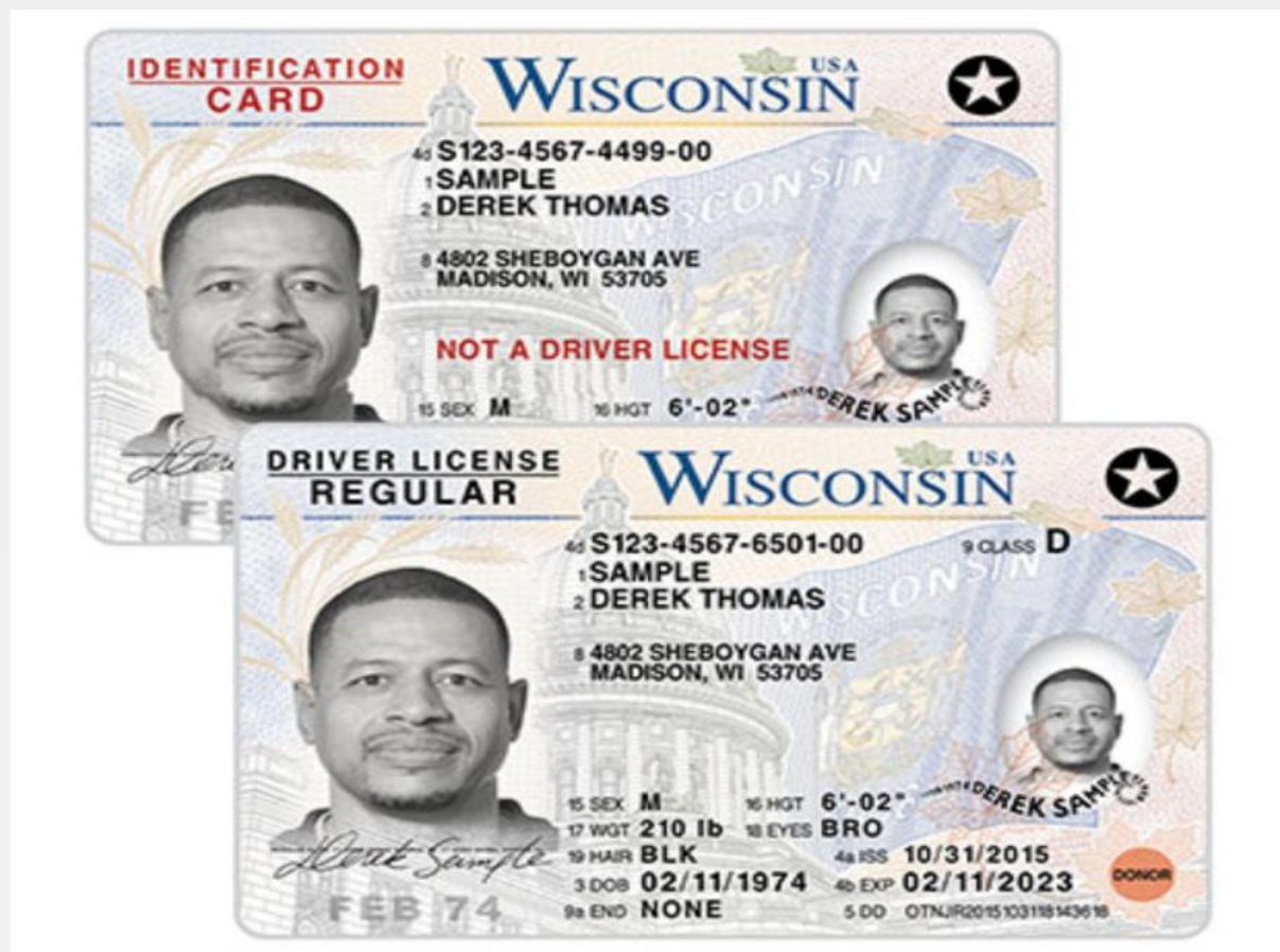
Sample cards starting Fall 2015

Wisconsin DMV issues REAL ID compliant products (marked with a ⚙) in accordance with the federal Real ID Act of 2005. If you plan to fly within the U.S., visit a military base or other federal buildings, the Department of Homeland Security will require identification that is REAL ID compliant (or show another acceptable form of identification, such as a passport) beginning May 3, 2023 , the new deadline for this Federal requirement.