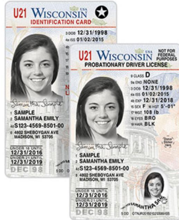
Sample under 21 cards starting Fall 2015