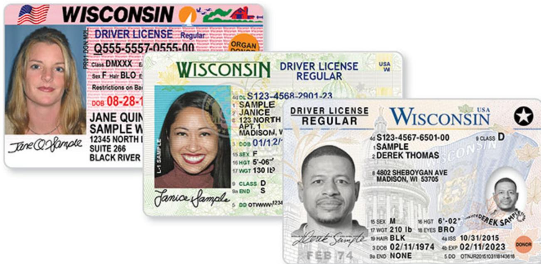
Three sample cards currently in circulation

Wisconsin will have three cards in circulation until older cards expire